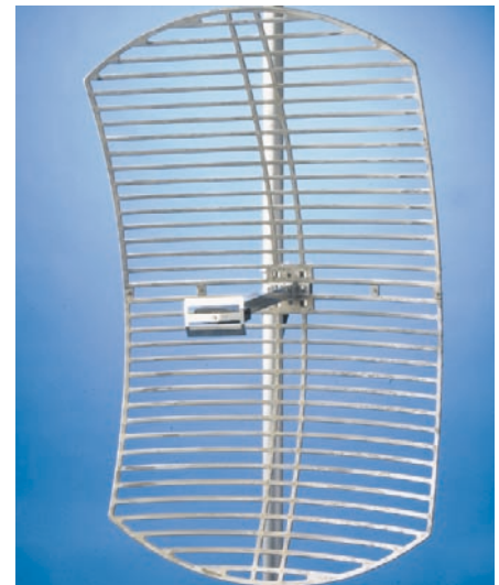
The low cost antenna durable enough to withstand changing climates